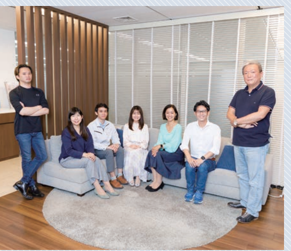
The Innovator is published by the Global Management Dept