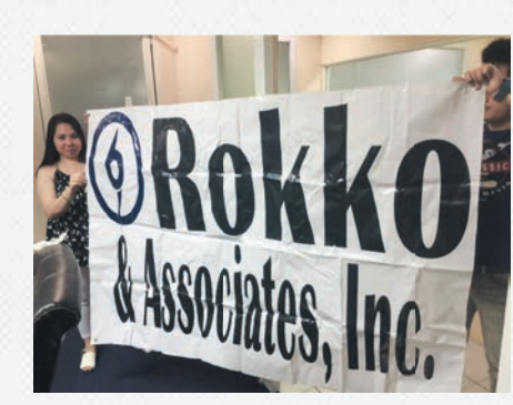
Company flag of the former Rokko and Associates.

the desired results. As a solution, we thought teaching Japanese to foreign staff rather than English to Japanese staff would help strengthen our human resources and enhance technical capabilities. After a careful examination of several candidate nations, HEXEL Works had refined its search and began recruiting from the wealth of English-speaking human resources in the Philippines.