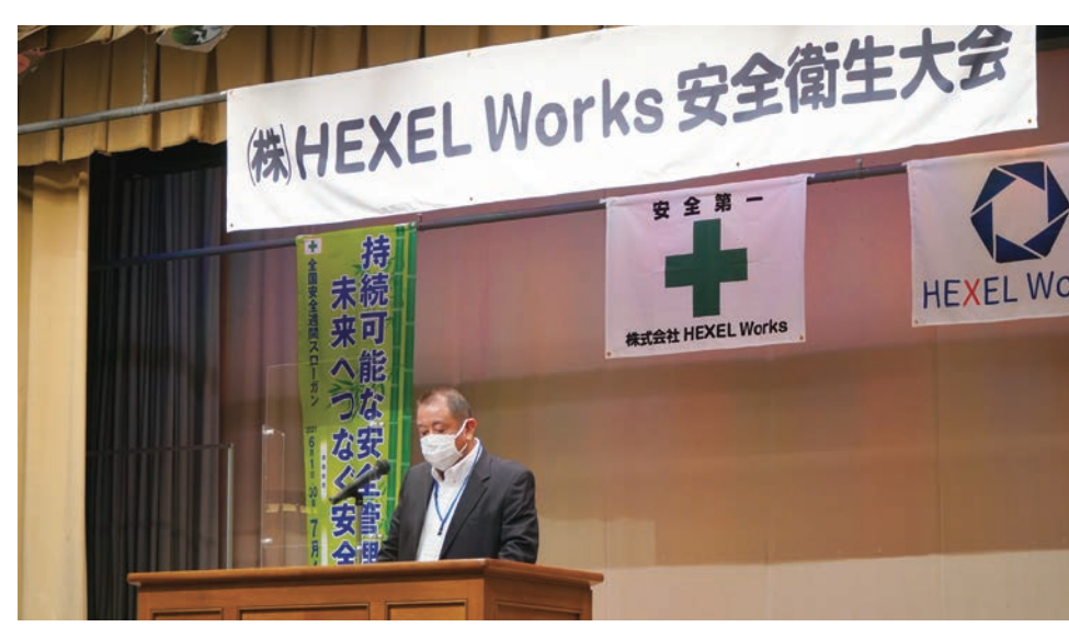
One of our Safety Conference

Japan has four seasons, with each one having something different for you to enjoy. Spring has cherry blossoms, summer has the sea, autumn has red leaves, and winter has snow. This summer, Japan plans to host the Tokyo Olympic and Paralympic Games, which were postponed last year. There are both pros and cons inside Japan with regards to hosting the games. However, I personally believe that, in consideration of the feelings of the athletes, the games should be hosted without any, or with a restricted number of, spectators. The rainy season, though not technically a season, comes at the beginning of summer, and it rains almost every day in Japan for one month. It usually ends around the middle of July, bringing the real start of summer. By the time you have