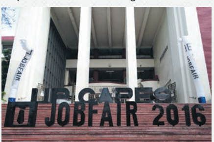
The recruitment drive at UP started from 2016!!

Our initial recruiting efforts targeted professionals with practical quantity survey and on-site experience who could immediately become technical assets. While the strength of these experienced candidates did broaden U.S. military construction projects, we encountered new problems. We now faced language barriers and the challenges of different work styles. In the beginning, we did not invest much time into Japanese language acquisition because we believed our Filipino employees would learn Japanese through immersion in Japan. This approach caused stress though due to communication errors between our on-site Japanese employees and Filipino recruits. This taught us the