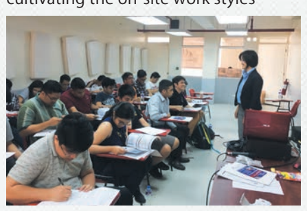
Providing company information at UP

value of having a Japanese education program unique to HEXEL Works for Filipino employees before they come to Japan. Another challenge was the difference in work styles. There was a gap between the Japanese work style in which one person handles multiple tasks and the Filipino work style which has a clear division of labor. These cultural differences resulted in some new recruits leaving the company. This insight led a shift at HEXEL Works from hiring experienced candidates to new graduates in 2015 so that we could develop our own engineers by not only providing comprehensive Japanese language training to inexperienced recruits but also cultivating the on-site work styles