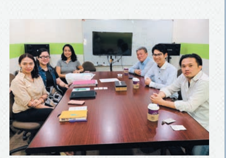
Meeting with the local Recruit Agent

Our recruiting efforts of new graduates in the Philippines continue today in spite of the novel coronavirus pandemic that has impacted our business activities worldwide since last year. We have steadily advanced recruitment this year by participating in online job fairs to hosting our own events to introduce the company. Anyone interested should definitely check out the employment information on Facebook and our company homepage! We look forward to meeting as many people as possible!